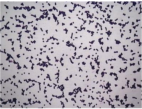
Figure 3. Gram positive cocci arranged in single, diplo, pairs, tetrads and grape-like irregular clusters. Magnification,×1000