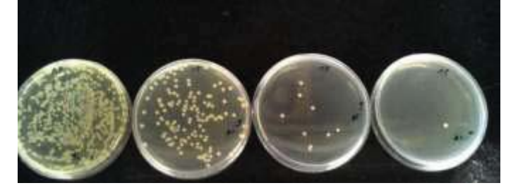
Figure 2. Surface culture of E.coli which form biofilm