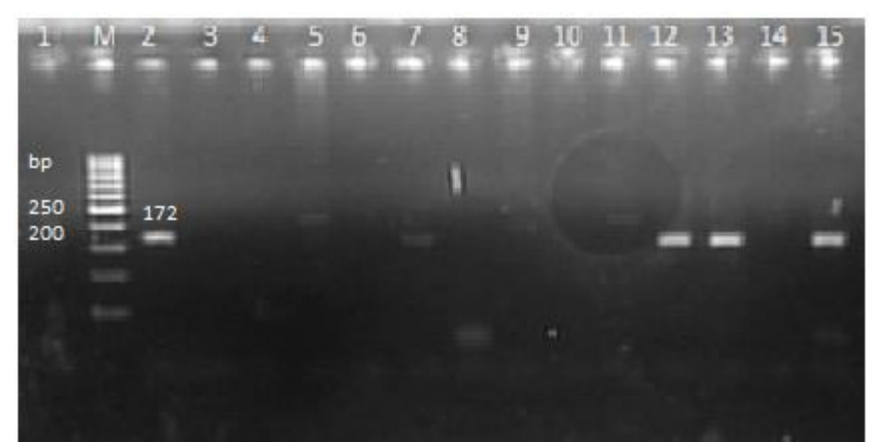
Figure 3. Gel electrophoresis of PCR products using ABI thermocycler device 1: Negative Control, M: DNA Marker (Leader 50 bp), 2,12,13,15: Positive cases (172 bp).